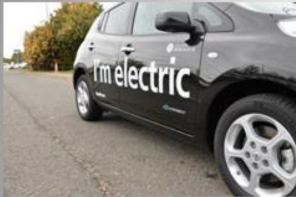
8 pool cars